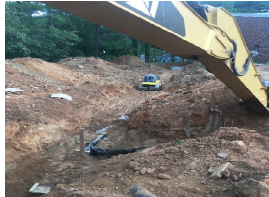
Rerouting Sanitary Line