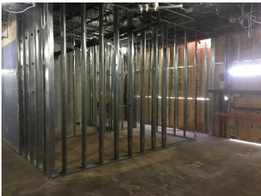
Interior Framing at Main Entrance