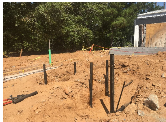
Building Addition Underground Plumbing