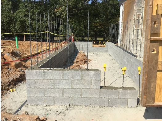
CMU Block at Stair 2