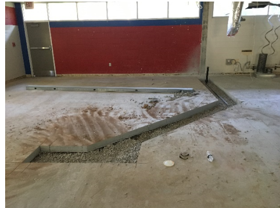
Building 2032 Plumbing Piping